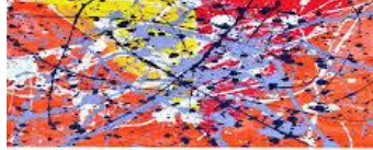
Paint Splatter Party